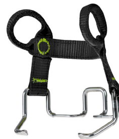
Crampon Binding Soft Back