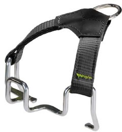
Crampon Binding Soft Front

EDELRID asks all owners of crampon soft bindings to check them for a correct combination of components.