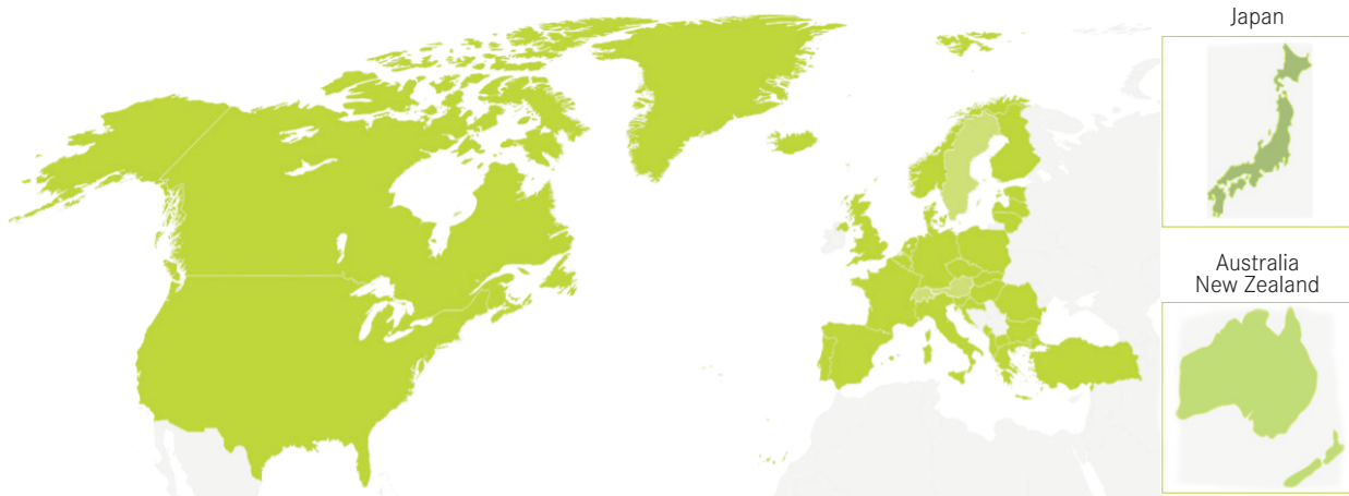
EDELRID AUTHORITIES sales countries in Europe Map view: